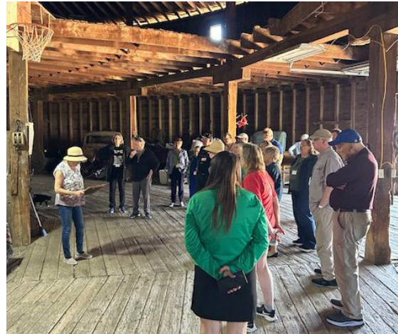
Group members learn about the history of the Starke Round Barn, a unique, three-story landmark built in 1902 and listed on the National Register of Historic Places.

This year's season of WanderNebraska Adventure Tours kicked off on April 21-22 with the Pioneer Prairie: Second Chance Tour.