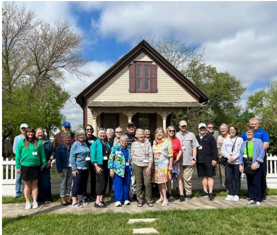
Participants gather for a group photo outside Willa Cather's childhood home during the Pioneer Prairie: Second Chance Tour.