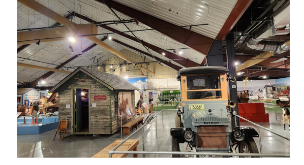
Legacy of the Plains Museum

Download the itinerary and register today .