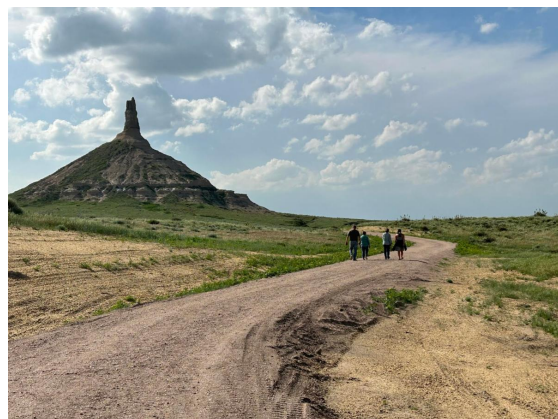
Walk To The Rock

Download the itinerary and register today .