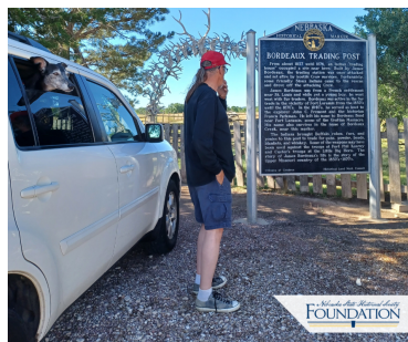
Harry at the Museum of the Fur Trade