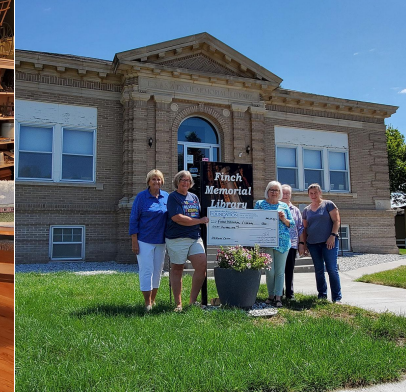
Washington County Museum