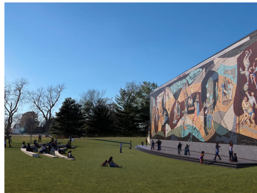
Bike path view of the mural

The Pershing Mural was carefully removed from the Pershing Auditorium over the summer, thanks to the fundraising efforts of a team dedicated to preserving the mural for generations to come. As announced recently, the Pershing Mural has found a new location where it will continue to be enjoyed by the public. All 763,000 tiles depicting 38 figures will be displayed on the Wyuka Cemetery Grounds, home of Lincoln's first public park.