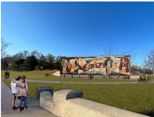
Bridge view of the mural