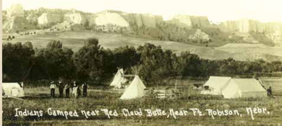
Indians Camped near Red Cloud Butte, near Ft. Robison, Nebr.