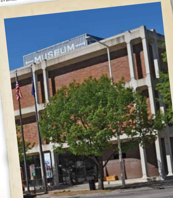
Nebraska History Museum