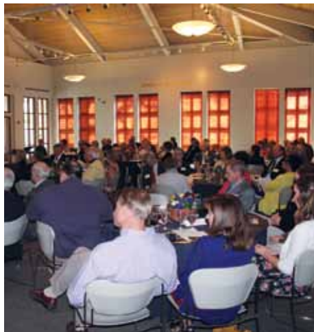
A full house at the Gerald R. Ford Conservation Center.